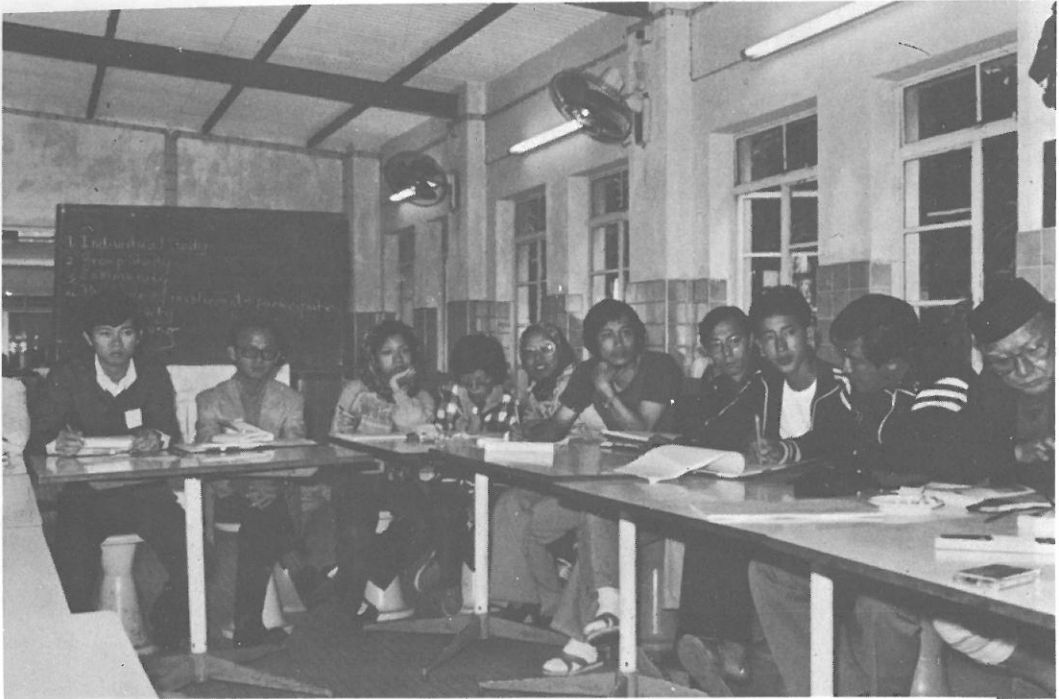
Some overseas participants from Muslim Converts Association, Singapore and BINA, Sarawak. The brothers and sisters from Hong Kong are seated in the Centre of the picture. 1980