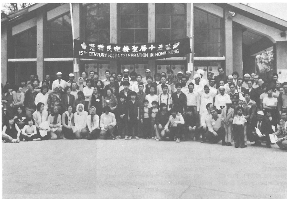
Some participants were lucky enough to get in for a Group photo before leaving the camp. 1980