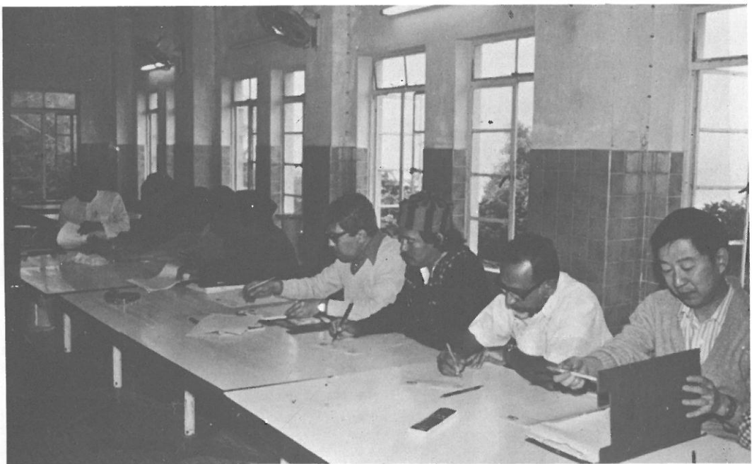
Another photo showing brothers from BINA, Sarawak, Japan and Taiwan deeply concentrated in the discussion at one of the sessions in the Camp. 1980