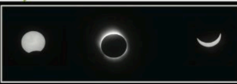
The Solar Eclipse in July 2009, Hangzhou, China 2009年日全蝕, 中國杭州