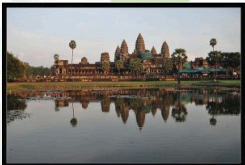
Angkor Wat, Cambodia 吳哥窟, 柬埔寨

真主給了我們美妙的國土。在古蘭經中「他以大地為你們的安息之所, 他為你們在大地上開闢許多道路, 以便你們達到旅行的目的地。(古蘭經43:10)」。哪我們有可能的話, 便應找一個機會去了解世界的一小部份, 試試用腳走, 用心看。享用真主為我們開闢的天地! 「讀萬卷書, 亦更要行萬里路。」