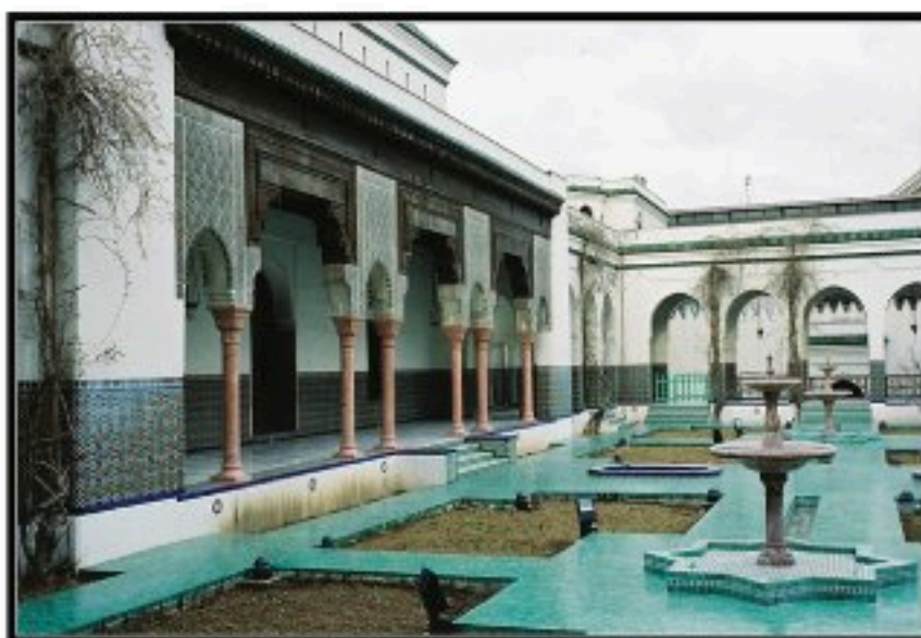
Paris Grand Mosque, Paris, France 法國巴黎市清真寺