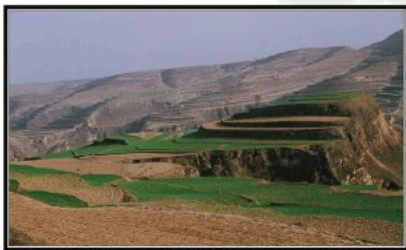
甘肅 黃土高原 Gansu Loess Plateau

Allah has granted us wonderful lands. The Quran says that, "[The One] who has made for you the earth a bed and made for you upon it roads that you might be guided" (Quran 43:10). Therefore, if it is possible, we should find an opportunity to understand the world around us, bit by bit. We should try to walk around more, look around more, and enjoy the creation that Allah has provided us with. "Practical experience is more useful than theories."