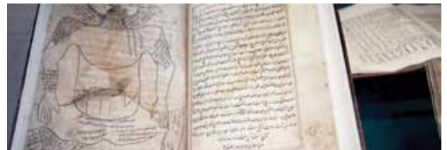
A Treatise on Anatomy, South Africa, 13th Century.

此帳幕 "Kiswa", 曾經於1964年在麥加天房門外掛上。這是一幅精心用金色和銀色的絲線刺繡成的「古蘭經」書法禱告詞。