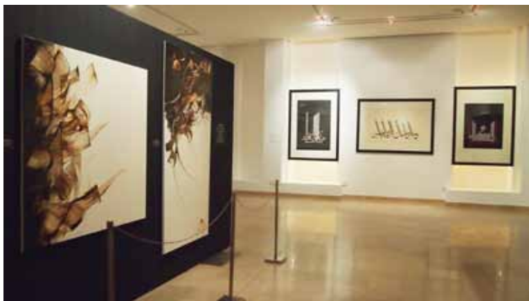
The Gallery exposition of the "NUN WA AL QALAM Contemporary Muslim Calligraphy" "NUN WA AL QALAM 當代穆斯林書法"的展館