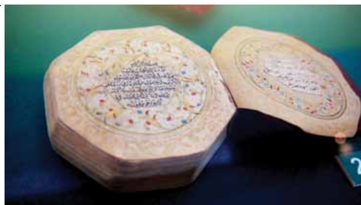
Miniature Quran – for the purpose of soldiers to carry. Miniature Qur'an manuscripts were usually prepared in an octagonal format.

微型「古蘭經」- 編制目的是為了讓士兵方便攜帶。微型「古蘭經」通常為八角形的格式編制。