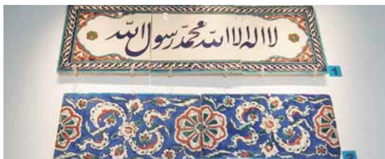
Islamic tin glazed pottery spread amongst the Islamic world and to Europe. Decorative tiles with Arabic inscription become popular after 18th century

我最近的一次馬來西亞旅遊，到了吉隆坡參觀馬來西亞伊斯蘭藝術博物館 (IAMM)，從而激發了我對伊斯蘭藝術的興趣。IAMM為全東南亞最大的伊斯蘭藝術博物館，收藏文物超過七千件。它的常設展覽館展出範圍從織錦畫，到人手編成有「古蘭經」經文的掛毯，至傳統的槍支物品等。這個博物館的規模不算十分龐大，但它是一個可令人感到驚訝及充滿了啟發性的地方，不僅吸引了穆斯林，對於藝術愛好者亦是一個不能錯過的好景點。