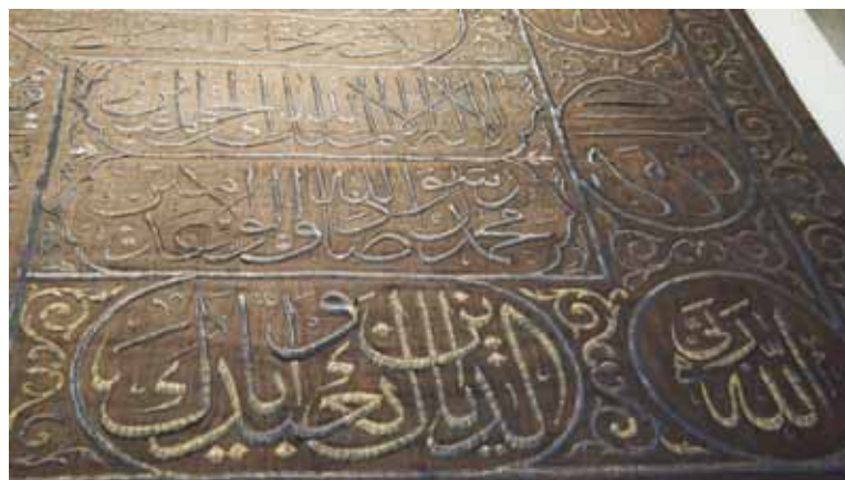
The Kiswa" that draped at the Kabaa in 1964, which was finely embroidered with gold and silver calligraphic inscriptions in Mecca.

此帳幕 "Kiswa", 曾經於1964年在麥加天房門外掛上。這是一幅精心用金色和銀色的絲線刺繡成的「古蘭經」書法禱告詞。