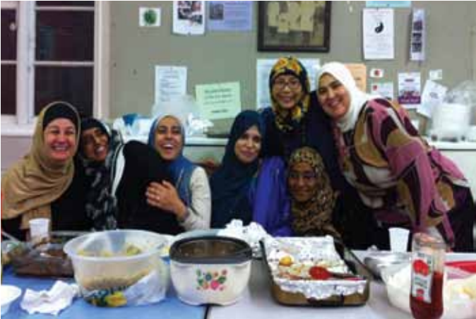
Muslim friends from Brazil, Pakistan, Egypt, Bangladesh and Africa at one of the monthly gathering 每月聚會有來自巴西、巴基斯坦、埃及、孟加拉及非洲的穆斯林婦女

根據《古蘭經》第2章第31節記載“人們啊！我確由男性和女性創造了你們，並使你們成為許多民族和部落，以便你們彼此認識。在安拉那裡，你們中最高貴的就是你們中最敬慎的。安拉確是深知的，盡知的。”這一章實際上解釋了，來至各地及居於各處，我們必須主動結交鄰舍，與人為善。如此，週遭的人就會歡迎你加入社群，待你如朋友般，正如你待他為朋友一樣。真主愛護與賞報每位待人友好，並以良善、真誠和耐心交友的人。